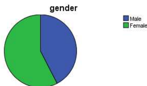
Figure 1: Pie Chart Showing the %of Males and Females in the Sample Taken

The study comprised of postgraduate students from a small town on the outskirts of Mumbai the family Income of the students is shown in Figure 2 and Table3 . The Postgraduation courses are expensive and most of the students come from middle class and upper middle class sections. 27.2 % of the sample belongs to the income category of 50,000-1 lakh Rupees per month and 65.6 % belong to the Income category of 1 lakh and above per month.